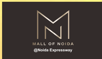
Sikka Mall Of Noida Sector 98, Noida