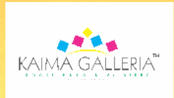
Sector 78, Noida