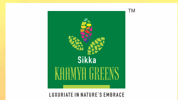
Sikka Kaamya Greens Sector 10, Greater Noida West