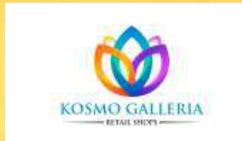
Sector 143A, Noida