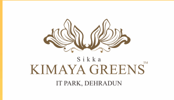
Sikka Kimaya Greens Doon IT Park, Aman Vihar, Dehradun, Uttarakhand 248001