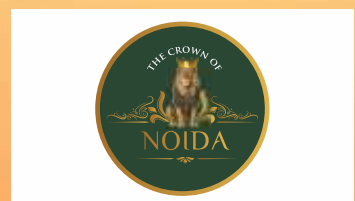
Crown of Noida FNG Noida Expressway