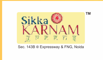
Sikka Karnam Greens Sec-143B, Noida