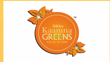
Sikka Kaamna Greens Sector 143A, Noida