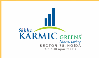
Sikka Karmic Greens Sector 78, Noida