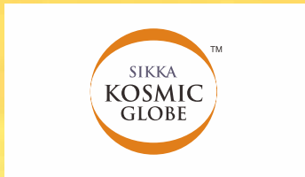
Sector 143B, Expressway