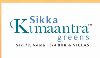
Sikka Kimaantra Greens Sector 79, Noida